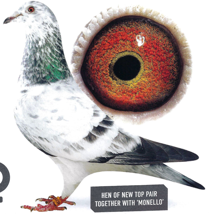
HEN OF NEW TOP PAIR TOGETHER WITH 'MONELLO'